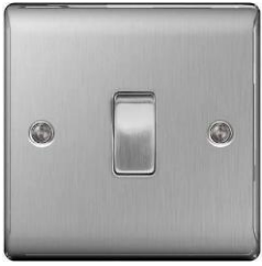
A square light switch