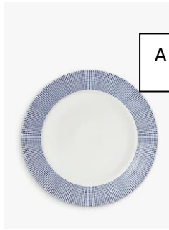
A circle shaped plate