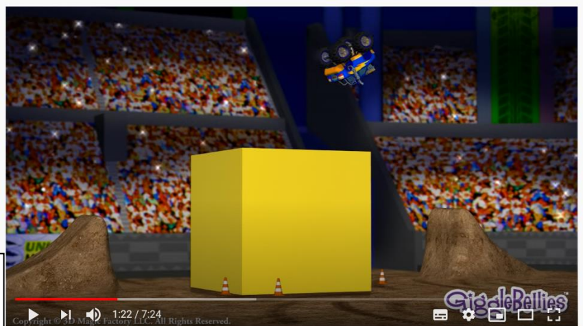
Monster Trucks Learn 3D Shapes | Episode 10

Make your own monster truck course. Can your cars flip over each shape?