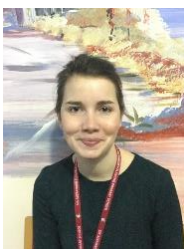
Deputy Head Teacher