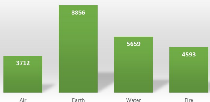
Autumn House Points 2022