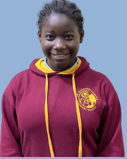
Meet our Head Boy and Girl.

They applied for the positions and were voted in by their fellow peers in school. They are both extremely sensible and very worthy winners. They have responsibilities in school which include giving tours of the school to visitors, welcoming parents at parent meetings, leading assemblies and giving out certificates. We are very proud of them!